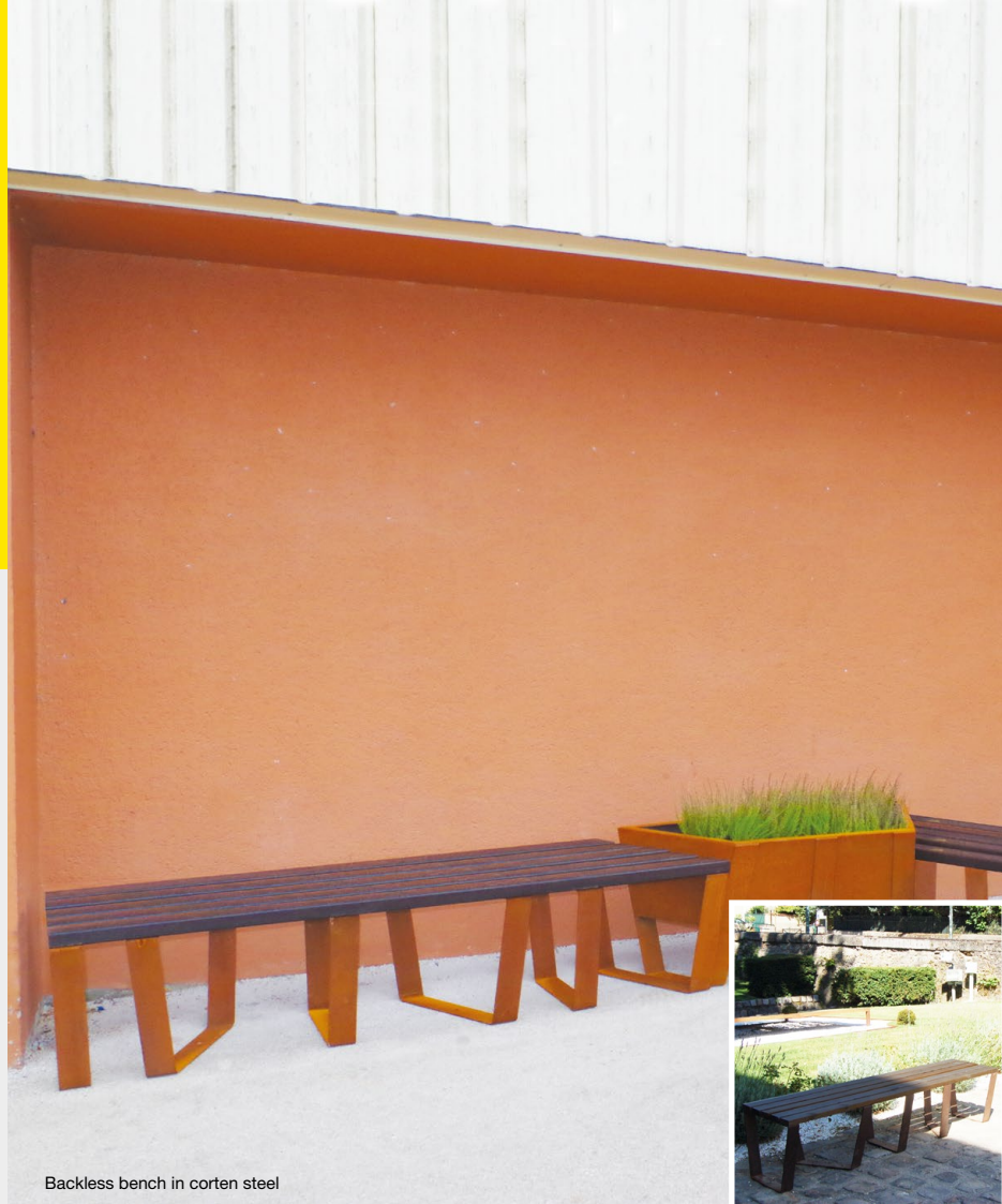
Backless bench in corten steel